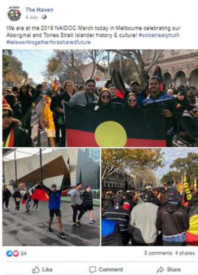
The Haven young people attending NAIDOC celebrations in Melbourne.