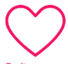
Equity, access, inclusion, belonging, trust and respect.